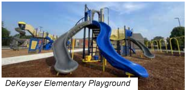
DeKeyser Elementary Playground

The modern and flexible design will reflect community pride and enhance neighborhood property values. It also represents the vision of how UCS will build on its legacy of excellence to transform its elementary schools with a focus on safety, innovative learning communities and classrooms that give teachers more flexibility to inspire remarkable achievement. The August 24 Open House is open to the entire community as an opportunity to see the investment they are making through the 2023 bond issue. For more information, please visit: www.uticak12.org/safetyandsuccess .