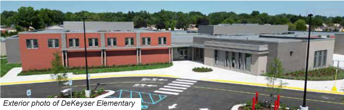
Exterior photo of DeKeyser Elementary