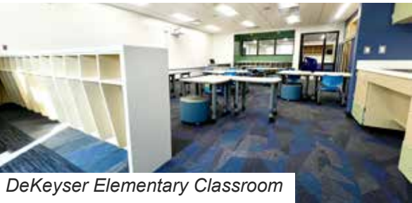
DeKeyser Elementary Classroom

The future begins this fall for Utica Community Schools, and our entire community is invited to celebrate. More than 500 DeKeyser Elementary students will start their year in a newly reconstructed school, introducing a design template to influence future work throughout the district. Opened more than 50 years ago, DeKeyser is the first of three UCS elementary schools that are currently scheduled for reconstruction. Over the next two years, both Graebner Elementary and Havel Elementary will be completely reconstructed to reflect the new building design.