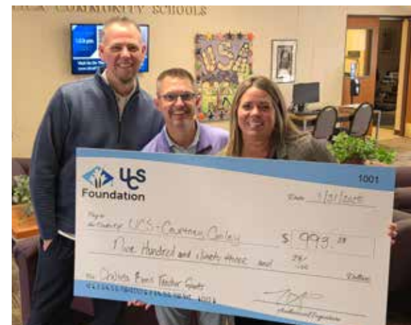
The UCS Instructional Technology Coaches received a grant to provide training to teachers on how to use children's literature to teach students how to use technology responsibly.

build strong foundational academic skills."