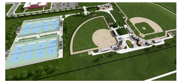
Artist rendering of Stevenson athletic complex.

The improvements on district-owned vacant property at Dodge Park and 16 Mile will include new baseball and softball turf fields, tennis courts, grandstands,