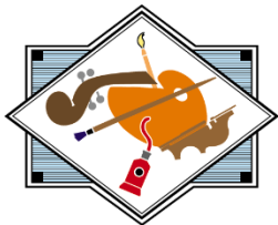
Arts & Communications