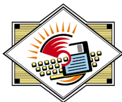
Business, Management Marketing & Technology