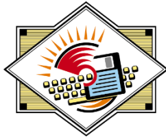
Business, Management Marketing & Technology