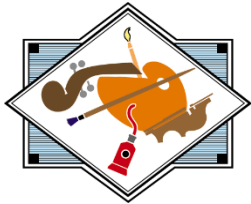
Arts & Communications